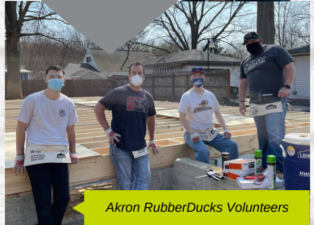
Akron RubberDucks Volunteers