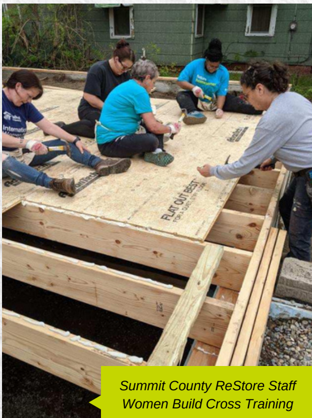
Summit County ReStore Staff Women Build Cross Training