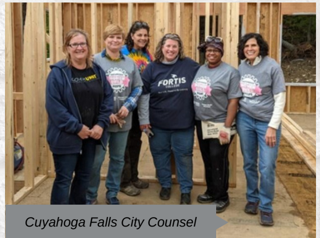
Cuyahoga Falls City Counsel