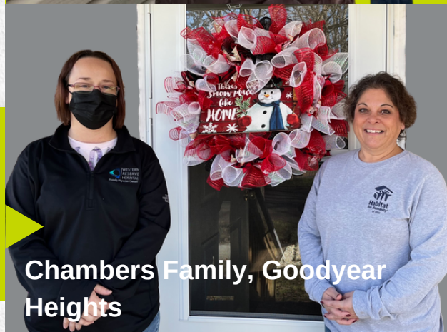
Chambers Family, Goodyear Heights