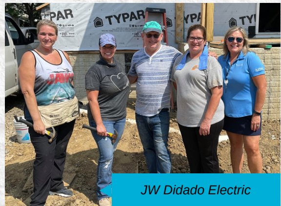
JW Didado Electric