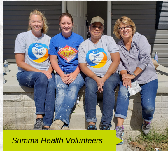
Summa Health Volunteers