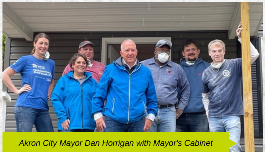
Akron City Mayor Dan Horrigan with Mayor's Cabinet