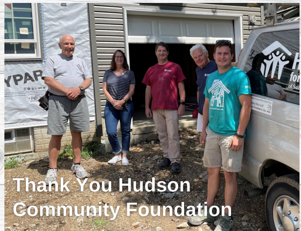
Thank You Hudson Community Foundation