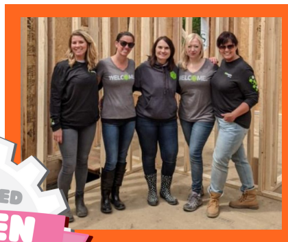
Huntington Bank Volunteers