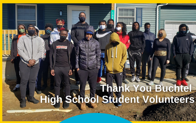
Thank You Buchtel High School Student Volunteers

Loving God, you made us in your image and blessed us with wisdom, creativity, skill, compassion, and love. Give our volunteers the sight to see how they can use their talents to serve those in need. Let us all hear your call to serve and the willingness to be your hands and feet in our community. Empower each volunteer with your strength and wisdom to build safe affordable homes. Thank you to each volunteer who dedicates their time and energy to help a neighbor. Bless us with willing hearts, Lord, and inspire us to action. Amen.