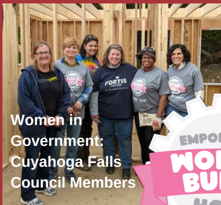
Women in Government: Cuyahoga Falls Council Members