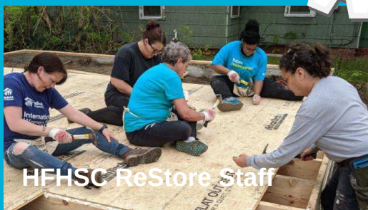
HFHSC ReStore Staff