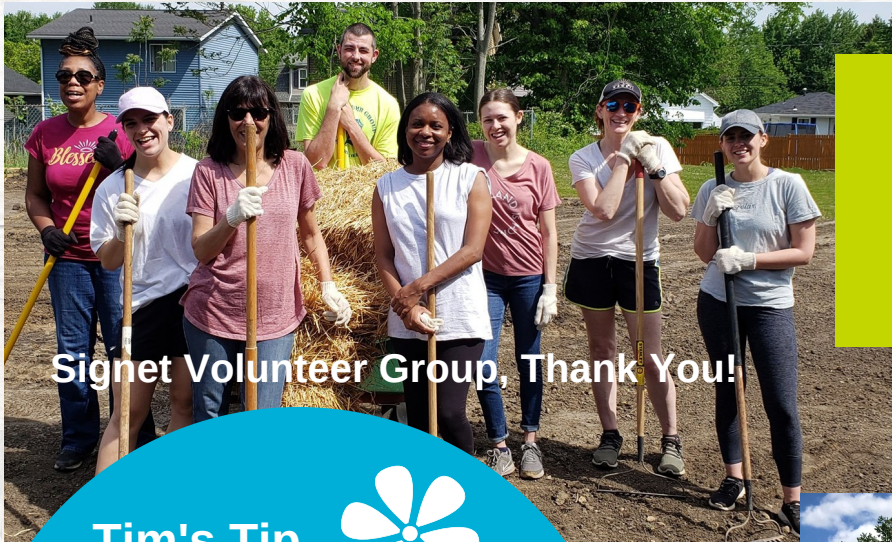
Signet Volunteer Group, Thank You!

Lord, thank you for all the generous donors and sponsors that support Habitat for Humanity of Summit County's work in our community. We pray that you bless us with all with generous and giving hearts to help those in need. Thank you for every blessing you give us. Let us never forget to help our neighbors and be kind to one another to share the love of Jesus with the world. Amen.