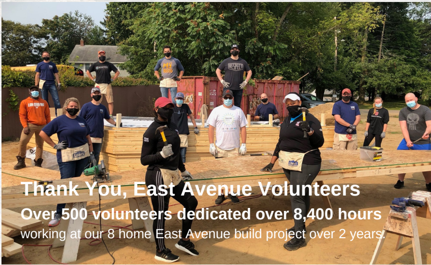
Thank You, East Avenue Volunteers Over 500 volunteers dedicated over 8,400 hours working at our 8 home East Avenue build project over 2 years.