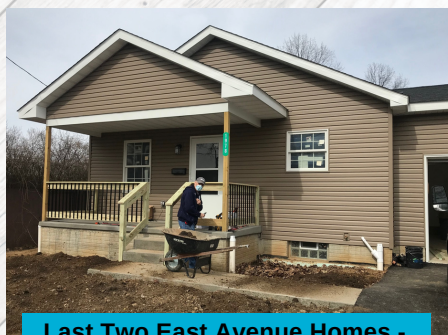
Last Two East Avenue Homes - Dedications on April 16th