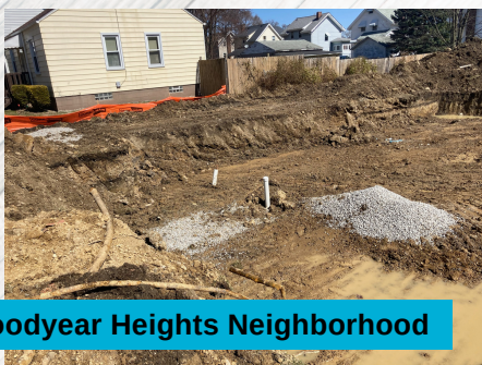
Goodyear Heights Neighborhood