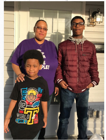
Carrington Family - West Akron