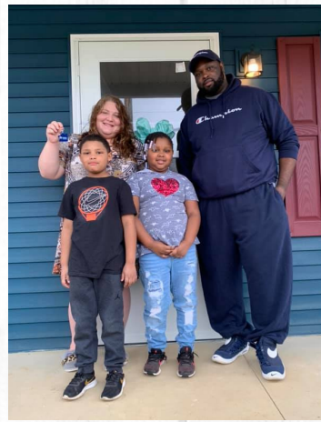
Lang/Coleman Family - East Avenue

Sharnice is a single mom of a one year old daughter.