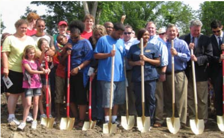
Twinsburg Partner Families get ready to break ground on their new homes.

For 2012, we are pleased to announce we will be continuing our efforts with more lots in the area. If you are interested in donating time, talent or treasures to the project, or know a family who would be a great partner for homeownership, please contact us at 330-745-7734 or habitat@hfhsummitcounty.org .