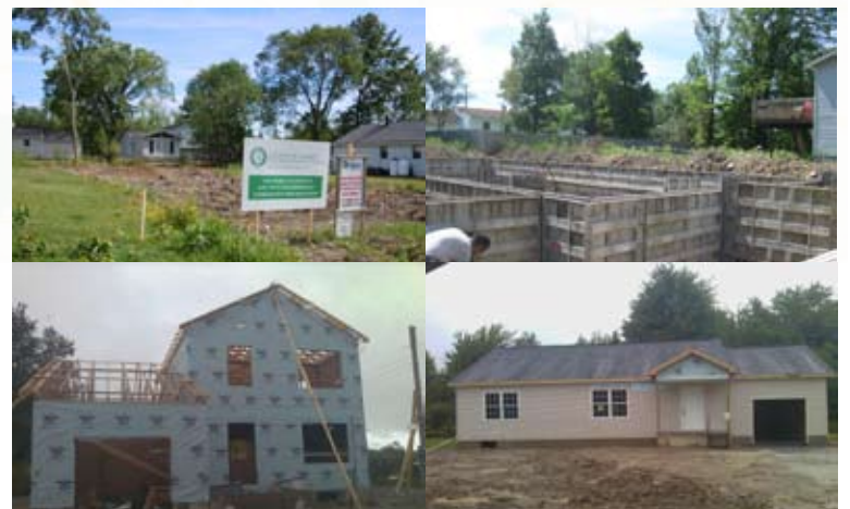
Four empty lots in Twinsburg Township become new Habitat homes.