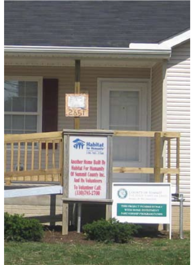
A house built through a HOME grant last year in Summit County.