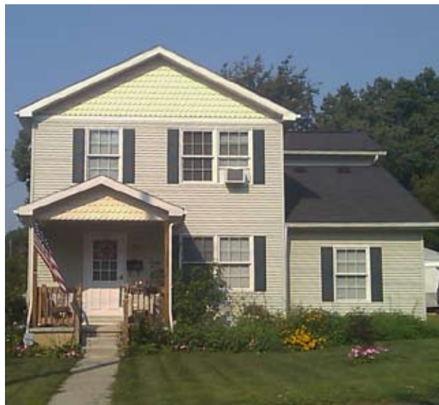
A Habitat for Humanity home built in Summit County.

Habitat for Humanity of Summit County will be working to incorporate the new mission statement and core principles into its strategic planning process next year.